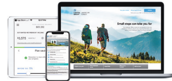
Plan participant website and mobile app