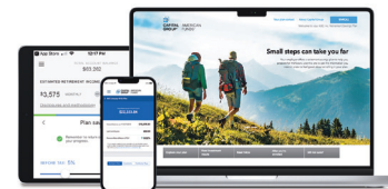
Plan participant website and mobile app